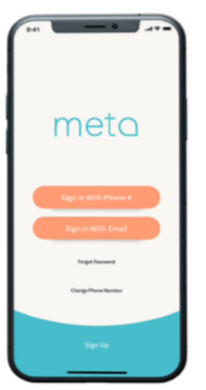
Verify your email and include Ranger College in your profile